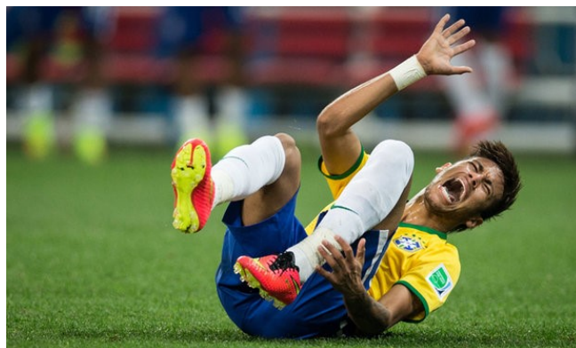
Brazil starlet Neymar displaying "Joga Bonita"