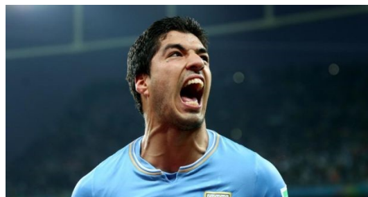
"Tengo hambre" - Luis Suarez

From the Stalinist show trials to the liquidation of the Kulaks, the unwavering strength of Russian might is seemingly unstoppable within the friendly confines of the Motherland. However, in what we can only assume is some sort of nod to the ethos of Trotsky's international revolution, Russia took their World Cup strategy global this summer, evidenced by the massive increase of paramilitary funding to Houthi rebels in Yemen after the opening match draw with Saudi Arabia. Additionally, one couldn't help but admire the genius of Russian subterfuge when, in their final group match against Uruguay, the home side coated their kits in the locally sourced Novichok nerve agent, resulting in Luis Suarez's poisoning and subsequent substitution after his inevitable attempt at physically