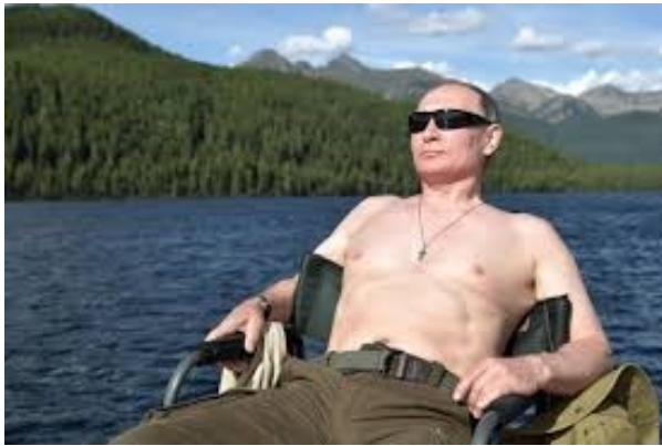
VI Putin, lawn gnome collector/ leader of the free world

Welcome to “Just Putin’ Around”, a special guest column by Russian President and amateur bear wrangler, Vladimir Putin. Editor’s Note: Use a Russian accent when you read this, like the Count or the antagonists from Rocky and Bullwinkle.