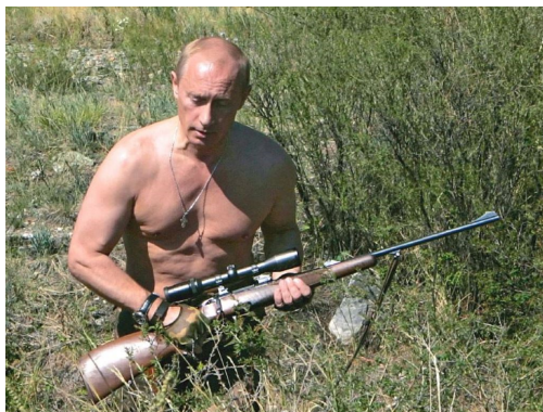
President Putin returning from "a team talk" with the Mexican National Team

Unsurprisingly, Russia emerged victorious from the tournament, having upset Brail 17-0 in the final in Moscow, in which 4 Brazil players were dismissed on questionable red cards before "voluntarily submitting" to extralegal "reeducation" in the tunnels of Luzhniki Stadium.