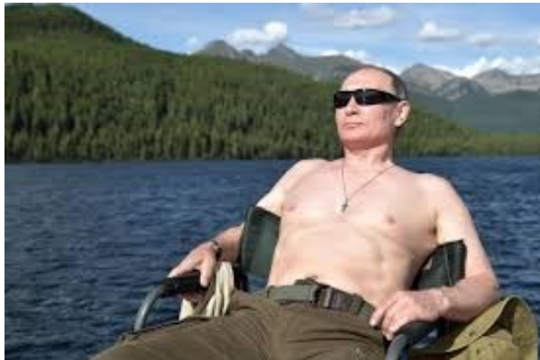
VI Putin, lawn gnome collector/ leader of the free world

Welcome to “Just Putin’ Around”, a special guest column by Russian President and amateur bear wrangler, Vladimir Putin. Editor’s Note: Use a Russian accent when you read this, like the Count or the antagonists from Rocky and Bullwinkle.