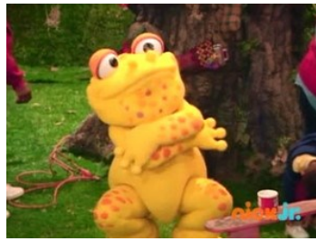
Binyah Binyah: anthropomorphic polliwog, potential Sadist

Speaking via inter-dimensional telelink, Rosewater stated, "I was just headed out of my office to get a coffee when I noticed that I had been violently ripped from my nodal position in the space-time continuum. When I came to, I was in some sort of cartoonish, Carolinian island prison."